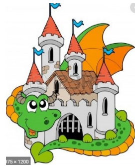
Dungeons and Dragons