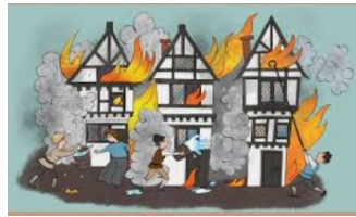
Great Fire of London