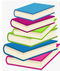
Hooked on Books