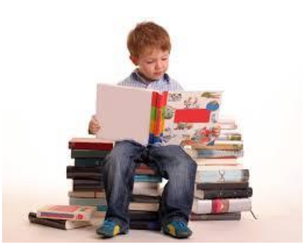
Enjoying a book