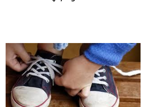
Tying my shoelaces