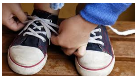
Tying my shoelaces

We will be using describing words to talk about pirates. Look up some images of pirates and take it in turns to talk about what they look like.