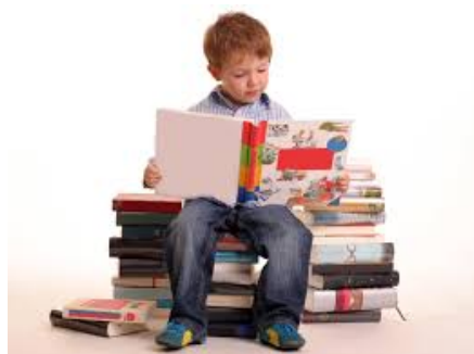
Enjoying a book